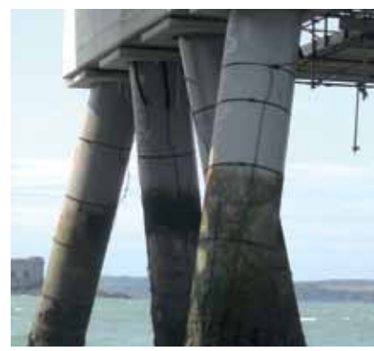
Milford Haven Cathodic Protection Project Client: Corrosion Control Services Ltd