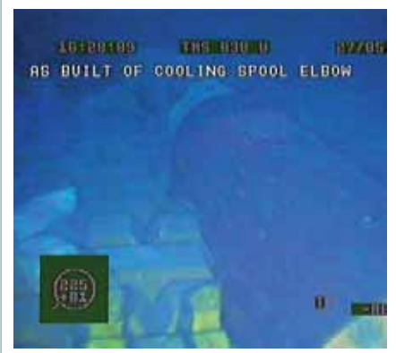
Erskine Project Client: Technip UK Ltd