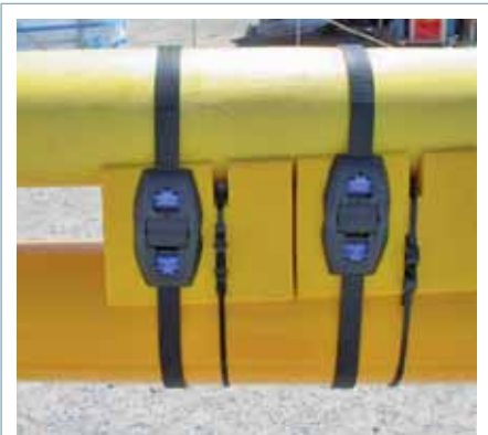
Vincent Project Client: Technip Subsea 7 Asia Pacific