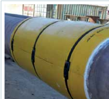
Kashagan Experimental Project Client: Cybernetix and Saipem