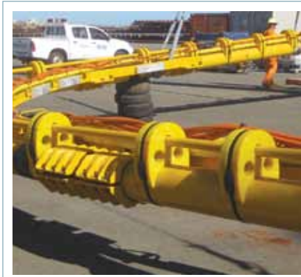
Enfield Phase 2 Project Client: Technip Oceania Pty

For full project information please visit our website www.hclfasteners.com/offshore-projects.php to find details of over 30 projects worldwide.