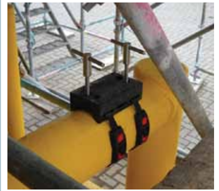
Doosan Babcock Energy Project Client: Doosan Babcock Energy