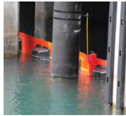
Norpac Enterprises Project Client: Norpac Enterprises