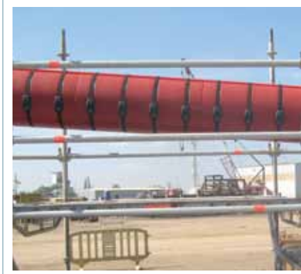
Tombua Landan Project Client: Acergy